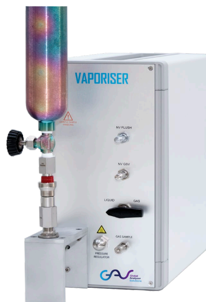
Figure 2 Vaporiser, basic version