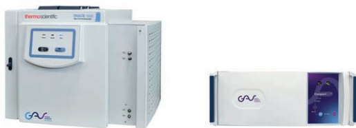
Figure 2 ppm-% level ammonia analyser on Thermo Trace GC1600 (left) and CompactGC 4.0 (right)